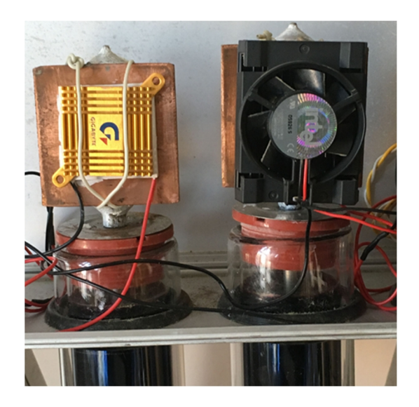
Fig. 2. Photo with thermoelectric module occur on the condenser of vacuum collector.

A test version of the solar collector are consists four vacuum tubes with diameter of 58 mm and length 500 mm (fig. 1). Collected heat through the heat pipe is passed to condenser which incorporated the design of the welded copper plate for placement the thermoelectric module. For drain heat from "cold" surfaces of the thermoelectric module used the radiator with fan (fig. 2). All thermointerfaces are covered with heat conductive paste KPT-8.