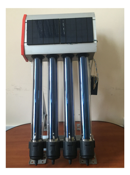
Fig. 1. Photograph solar thermoelectric generator.