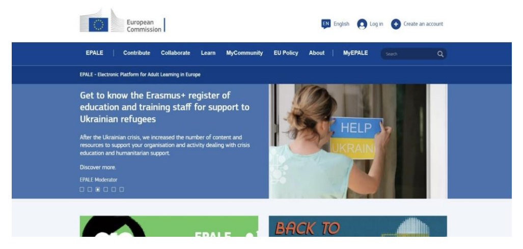
Fig. 5. Screenshot of the page https://epale.ec.europa.eu/

obtaining education. This register covers adult education, vocational education and training, general education at the pre-school, primary and secondary levels, including pre-school education and care. The registry allows teachers, trainers and experts, as well as other educators who are ready to work abroad in educational and training institutions, to register their profile. This profile allows searching for professionals with the relevant skills and competencies needed to support Ukrainian refugees (Fig. 5).