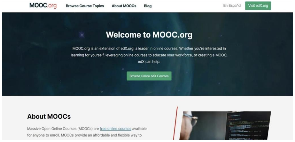
Fig. 6. Screenshot of the page https://www.mooc.org/

Online education in the form of mobile applications, open educational resources and open online courses, such as MOOCs (Massive Open Online Courses), opens up flexible opportunities for different categories of Ukrainian refugees abroad – https://www.mooc.org/. These are public, widely accessible, distance learning courses with the use of distance technologies, unlimited interactive participation of users, and open access to the Internet. They allow for discussions in social networks, serve to exchange information between communities of students and teachers, and enable online assignments. The most popular online courses in the world are Coursera (www.coursera.org), edX (www.edx.org), XuetangX (www.xuetangx.com), Udacity (www.udacity.com), and Khan Academy (www.khanacademy.org) (Fig. 6).