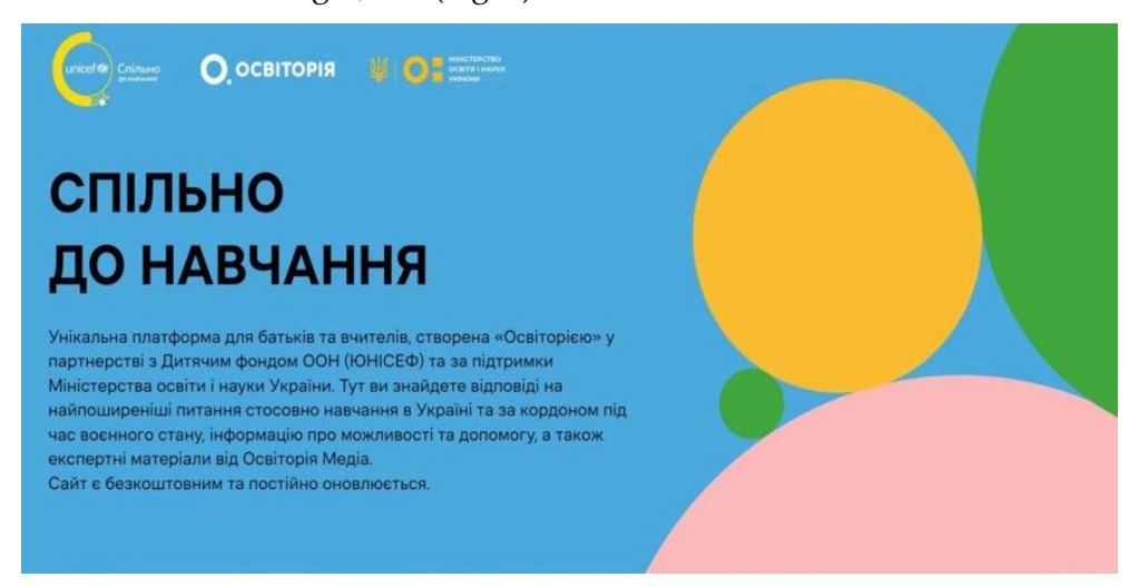
Fig. 1. Screenshot of the page https://osvitanow.org/

various educational opportunities, download expert materials, safety instructions, lessons and working materials on mine safety, psychological and social support, as well as nutrition, hygiene, immunizations developed for children of different ages, etc. (Fig. 1).