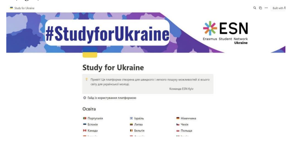
Fig. 4. Screenshot of the page Study for Ukraine

The Erasmus Student Network (ESN), together with ESN Ukraine and with the support of the EU, has created a new platform Study for Ukraine, which provides information on educational opportunities and support programs for Ukrainian students and researchers. The "Education" section contains stepby-step instructions on how to apply for higher education and scholarships for Ukrainian youth in 17 EU member states (Fig. 4).