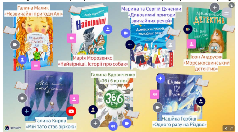
Figure 2. A selection of literary works for children that contribute to the speech development of younger schoolchildren (Hryvnak, 2023).

In addition, in order to activate and replenish the vocabulary of younger school students, we offered an interactive poster with a selection of literary works that are accessible and interesting for their age (see Figure 2). In our opinion, this will cause students to love reading and develop expressiveness and clarity of speech, shaping their speech development.