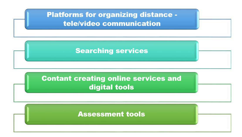
Figure 2. Means of effective formation of ICT competence grouped by tools' specifics

Wisely organized Google Classroom allows a future specialist to create meetings and use this platform to send assignments and announcements to target audience, organize surveys and polls. Then tasks are completed and uploaded to the platform with the following opportunity to constantly communicate with all the participants of the events. This service is closely connected to other main services, for example, Google meet, Gmail, Google Drive, YouTube, etc.