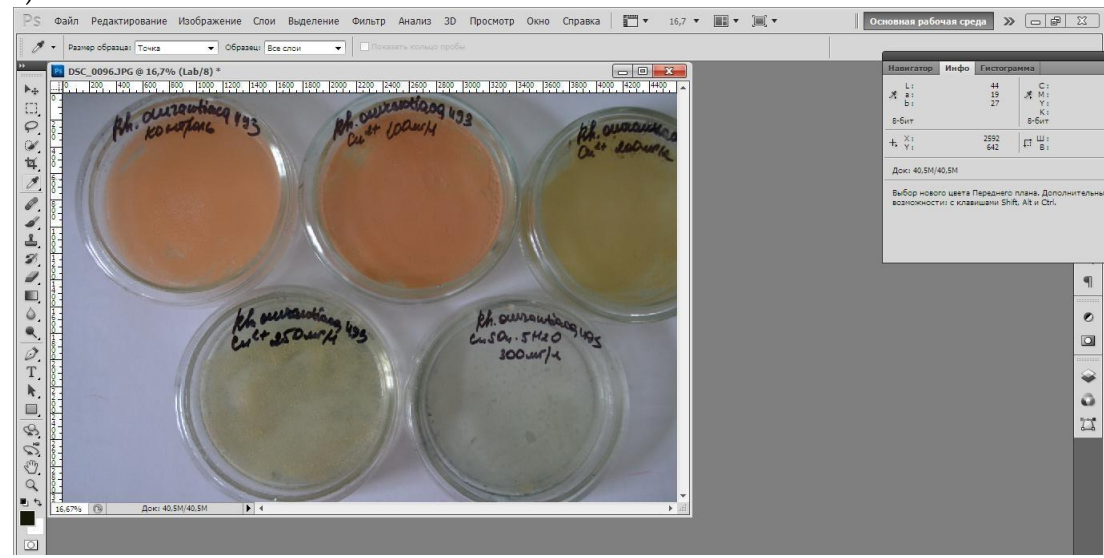
Fig. 1. Defining Lab color model parameters in Adobe Photoshop CS8

After visual assessment of the intensity of pigment accumulation of yeast colonies, Petri dishes with grown cultures were photographed at a distance of 25-30 cm from the camera objective in the "Macrofilming" mode without flash. A Nikon D3100 digital SLR camera was used. After that, the photos were loaded into the Adobe Photoshop CS8 graphic editor. A Gaussian Blur filter with a Radius of 20 pixels was used to remove minor digital noise in the image. After that, the "Lab" mode was set and the parameters of each of the three channels were obtained: L - brightness; a – the value of the red-green component; b – the value of the yellow-blue component (at 10 arbitrary points of the Petri dish; the number of petri dishes in the sample is 5 Petri dishes for each sample of Copper ions concentration) (Fig. 1) (Rylsky et al., 2010). Unlike the classic RGB model, it is the Lab color model that represents colors as they are seen by a person with normal eyesight. After that, the average arithmetic value was calculated for each of the Lab channels, the data was entered into the CIEDE2000 program, and the dE value was obtained (the difference in the intensity of pigment accumulation of the yeast culture between the control and experimental samples).