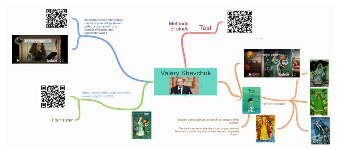
Fig. 1. Mind map "Biography and works of Valery Shevchuk", created in the service Coggle.it

Here are the examples of mind maps created by students in classes on "Children's Literature and Methods of Teaching Literary Reading" and "Foreign Language" (Fig. 1, 2, 3).